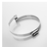
Clip-Grip Hose clamp, screwable