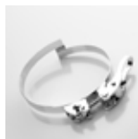
Clip-Grip quick action clamp